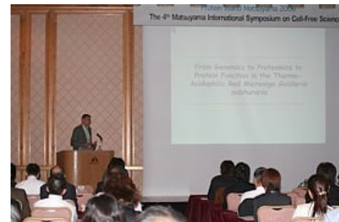
Invited speaker's talk